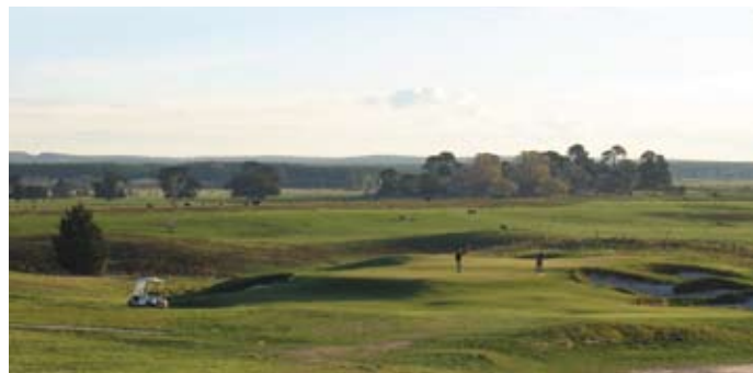
Mountain Views, gently undulating fairways and quick greens

Longford-Rosedale Road, LONGFORD Ph: (03) 5149 7230