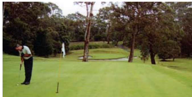
Picturesque course dry all year, renowned for kangaroos on course.

South Gippsland Highway, YARRAM (3kms east of Yarram) Ph: (03) 5182 5596