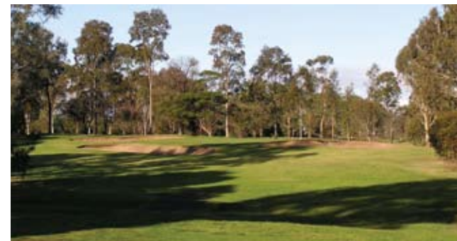
Excellent Greens, gently undulating fairways for an easy walk.

Fulton Road MAFFRA VIC 3860 Ph/Fax: (03) 5147 1884 • Email: maffragolf@vic.australis.com.au