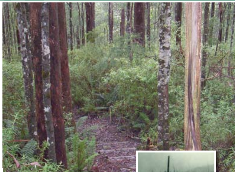
The Heart of Gippsland