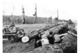
Bill Duff transferred his mill from Jeeralang to Balook in 1944. The mill used timber grown on the level land above the mill and winched logs from the steep valley below the mill.

A Government plantation program began in 1948 reclaiming the early logged and abandoned settlement areas once more to trees. These plantations now form the basis of an ongoing timber industry.