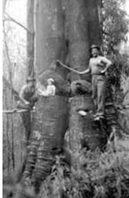
This photograph of the Duff family shows that the logging business in the early 1900's was certainly a family affair including the youngest member baby Kevin Duff. It also demonstrates the size of the enormous trees found at that time in the Balook region.

The Heritage Trail includes good examples of the current forest mosaic landscape in the Eastern Strzelecki Ranges following extensive disturbance that occurred in the late 19th and early 20th Centuries from clearing and logging. It includes remnant old growth eucalypts, regenerating rainforest, an enchanting Blackwood forest once dominated by eucalypts, and examples of commercial timber plantation. The trail is a project installed and maintained by Grand Ridge Plantations, current managers of this native forest for conservation purposes.