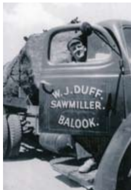
Andy Campbell in Bill Duff's truck c 1948

Early settlement involved cutting the large trees, burning all but a few that were sawn for timber, and sowing the area to pasture. Tough people were required. By the 1940's only a few areas remained uncleared.