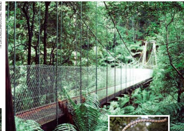
The Heart of Gippsland