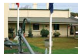
Heritage & History