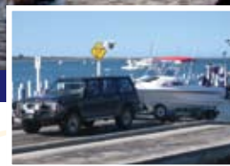
Boating & Fishing