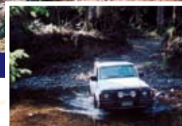
High Country Adventures