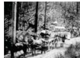
A typical scene in the timber regions of Balook was the Miles family with their team of horses harnessed and ready to travel. The family home is in the background.