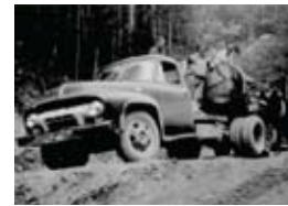
Fallen timber making its way to Duff's Mill for the next process.