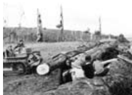
Bill Duff transferred his mill from Jeeralang to Balook in 1944. The mill used timber grown on the level land above the mill and winched logs from the steep valley below the mill.