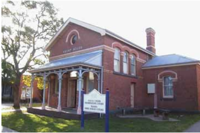
The Visitor Information Centre is housed in the beautifully restored Maffra Court House, built in 1888.

Maffra is being widely heralded as a regional lifestyle alternative for the many city folk looking to relocate to the country. Known for its hospitality, tranquility and social wellbeing, Maffra provides well for the service of the ageing while having some of the best sporting facilities in the State.