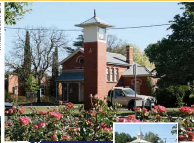
The Heart of Gippsland